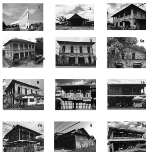
Figure 5: The example of Heritage Tourist Attraction.