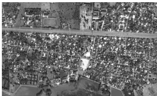
Figure 1 Map of Tha Rae Community.

Promised Land for many groups of people who came under their pastoral setting. Among those, it may have included people who had escaped from Vietnam forces in the defeated city of Vietnam. The Tha Rae community is situated by Nong Harn Lake, off the main highway 22 (Udon Thani - Nakhon Phanom), at 169 - 170 Kilometres. It is located north of Sakon Nakhon City with the distance by car of about 21 Kilometre and 6 Kilometre by boat. This community is considered a Tha Rae sub-district municipality with a population of over 7,095 people.