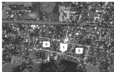
Figure 4: Walking tour route (adapted from Google Earth, 2016).

Route 3 Walking route: Walking tour or travel on foot are alternative ways of sustainable tourism. They cause no pollution. And travel on foot is one good way to see attractions closely. A walking tour is designed to combine important landmarks within the study area. The tourists will appreciate the portrayal and authenticity of the way of living, churches and houses.