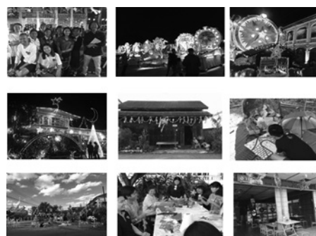
Figure 37: Tha Rae Stars Parades Festival

- The opportunity to promote OTOP (One Tumbon One Product) project for the community. For example, by studying the Star Paper craft Model, a “Tha Rae” style image of The Nativity of Jesus, could be created. Villagers can make and sell them.