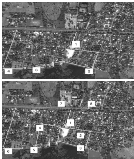
Figure 3: Bicycle route (adapted from Google Earth, 2016).

With historical signage and other interpretative tools, a heritage trail could increase an awareness of local history and provide a way to tell the history of the neighborhood, its development and its residents.